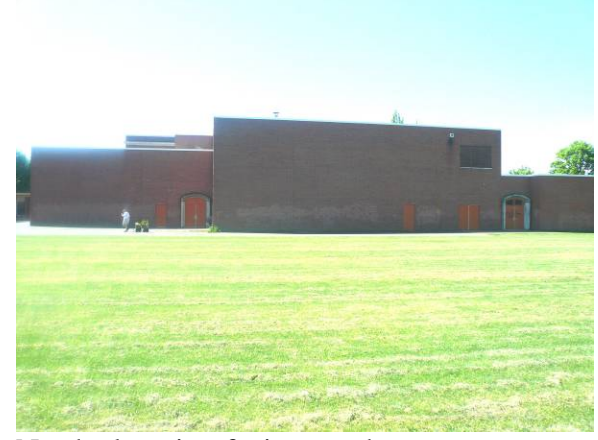
North elevation facing south

Kellogg Facility Exterior Photos ENTRIX 2009