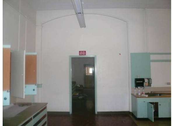
3<sup>rd</sup> Floor corridor facing east