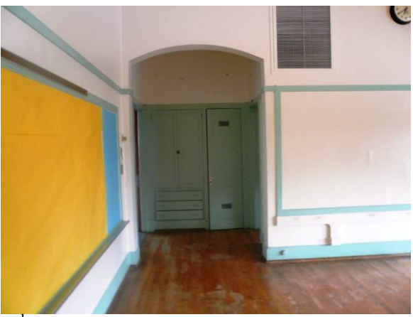
3<sup>rd</sup> Floor classroom facing north