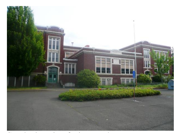
South elevation facing north