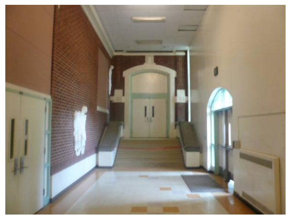
Corridor outside gymnasium