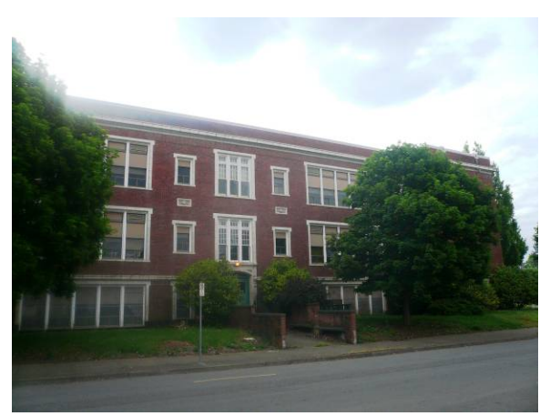
West elevation facing southwest