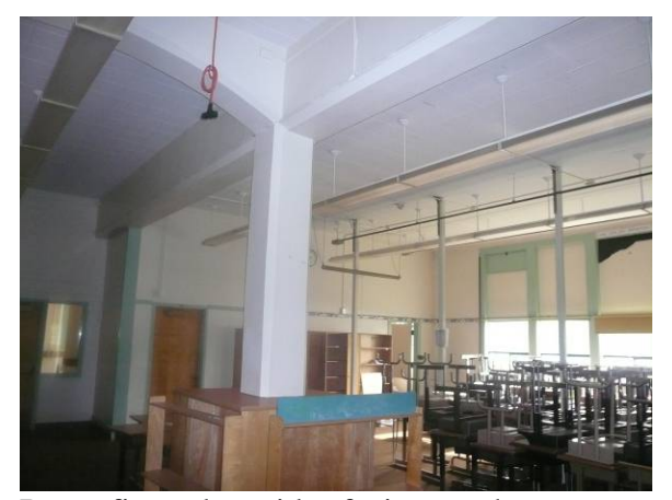
Reconfigured corridor facing northeast

Kellogg Facility Interior Photos ENTRIX 2009