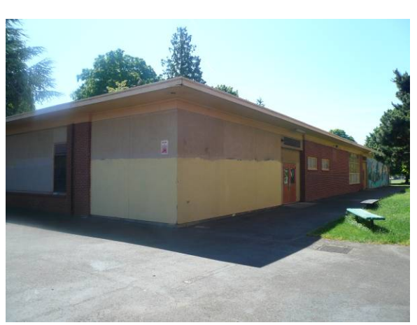
Annex facing southwest