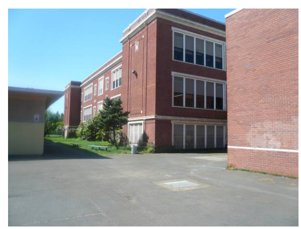
East elevation facing southwest